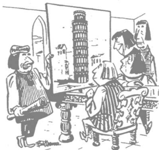
Fig. 2. The Town Council of Pisa stated: As you can see, thanks to savings on geological-engineering research, a remarkable piece of work has been created

selected on purpose, and not at the basis, thereby curtailing and simplifying the path of transferring from elements of geological identification (R) to parameterization of features of a rocky and soil medium (K).