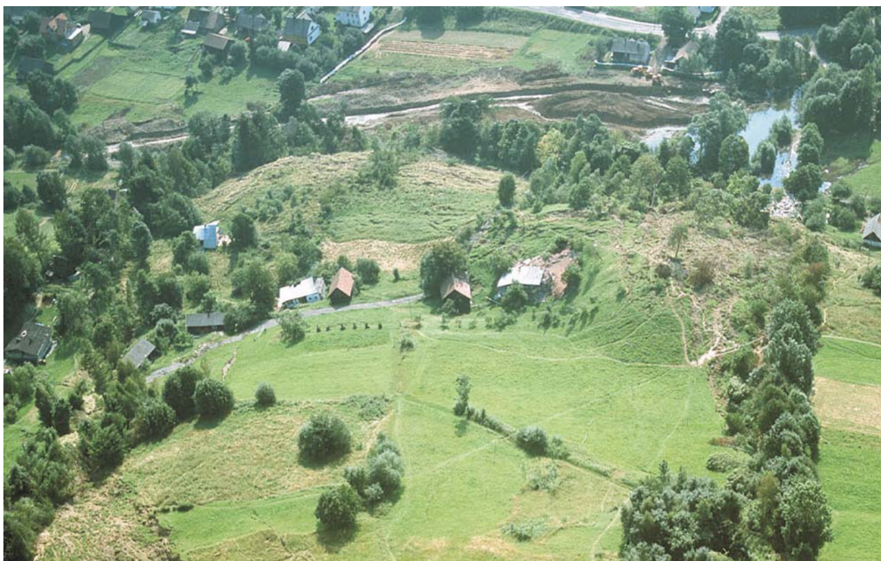
Fig. 4. Aerial picture of a fragment of a landslide in Lachowice — 2000 (Ostrowski et al., 2003)

Fulfillment of these programs requires an appropriate resource base referring to the subject matter, in the shape of research-documentation works as well as instructions for preparing geological-engineering documentation for reservoirs of small and large capacity, considering the specific