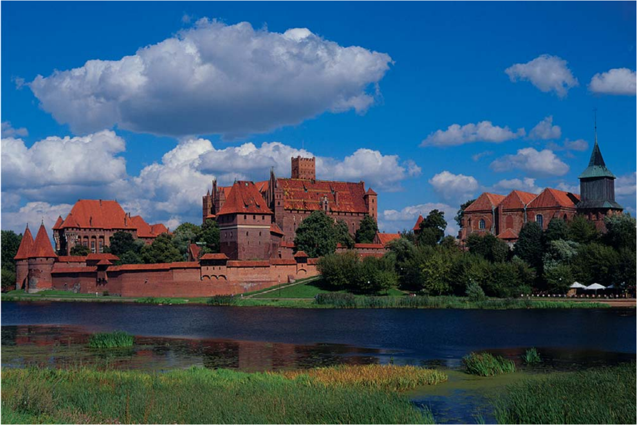
Fig. 9. Malbork (Germ. Marienburg ), the Ordensburgen

In the capital of the Lower Silesian Province, Wrocław, invariably we head for the Old Town pulsing with tourists and local social life. Its central point is situated in a market with a Gothic City Hall surrounded by tenement houses (Fig. 10). Before we allow ourselves to become tempted by menus of many stylish establishments – let's visit the local historical buildings first. The main building of the University of Wrocław is the biggest Baroque building in the city. One can visit the Leopoldin Hall built in the first half of the 17th century – the biggest secular interior in Wrocław. The oldest part of the city is called Ostrów Tumski. Today, there is a complex of religious buildings with the Gothic Cathedral of St. John the