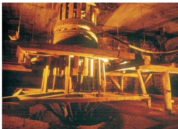
Fig. 5. Horse-driven treadmill in Wieliczka Salt Mine

In Cracow and its environs, mineral groundwater is used for therapeutic use. Practically in the middle of the town (Podgórze district) there is a medical health centre called Mateczny where sulphate waters are used in therapy. Similar waters occur and are utilised in therapy in Swoszowice (southern part of the city) and in the nearby health resort of Krzeszowice.