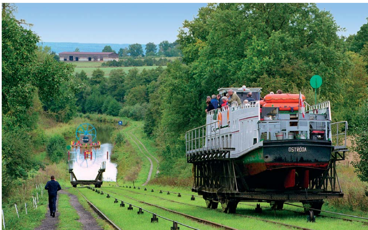
Fig. 11. Elbląg Canal, a pleasure – boat on the canal's slipway

For over 130 years, the waterway has been operated and maintained by a company called Żegluga Ostródzko-