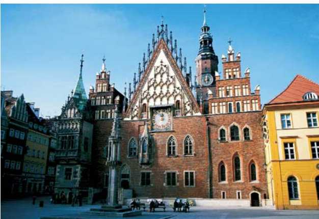
Fig. 10. Wrocław, the Town Hall – it was built at the turn of the 14th and the 15th centuries in the Gothic and the Renaissance styles. Its interiors including Gothic vaults are worth seeing

In the capital of the Lower Silesian Province, Wrocław, invariably we head for the Old Town pulsing with tourists and local social life. Its central point is situated in a market with a Gothic City Hall surrounded by tenement houses (Fig. 10). Before we allow ourselves to become tempted by menus of many stylish establishments – let's visit the local historical buildings first. The main building of the University of Wrocław is the biggest Baroque building in the city. One can visit the Leopoldin Hall built in the first half of the 17th century – the biggest secular interior in Wrocław. The oldest part of the city is called Ostrów Tumski. Today, there is a complex of religious buildings with the Gothic Cathedral of St. John the