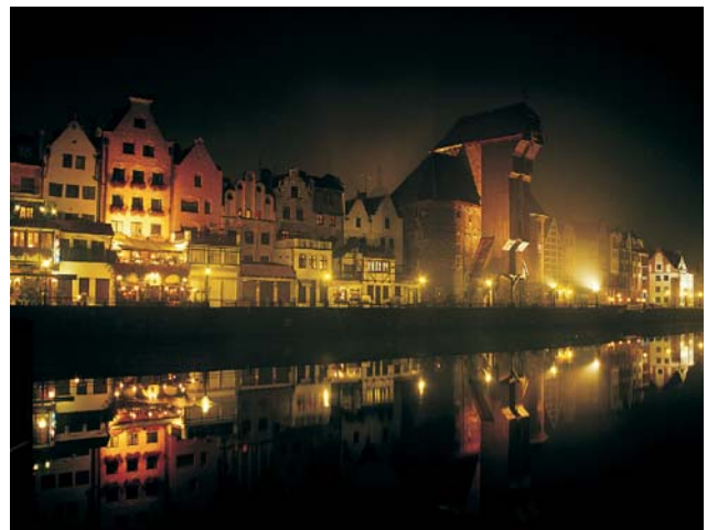
Fig. 7. Gdańsk by night – the Old Town in Gdańsk, Długa Street

From Mariacka street we enter the door of the main church in Gdańsk – the Basilica of the Assumption of the Blessed Virgin Mary. Inside the church there are many excellent medieval and Baroque works of art including Pieta from 1410 depicting the Virgin Mary cradling the dead body of Jesus; a copy of The Last Judgment by Hans Memling painted in 1472, and the main altar built between 1510 and 1517. The sacred building is an outstanding monument of Gothic Brick art, the largest brick church in the world, and one of the largest Brick