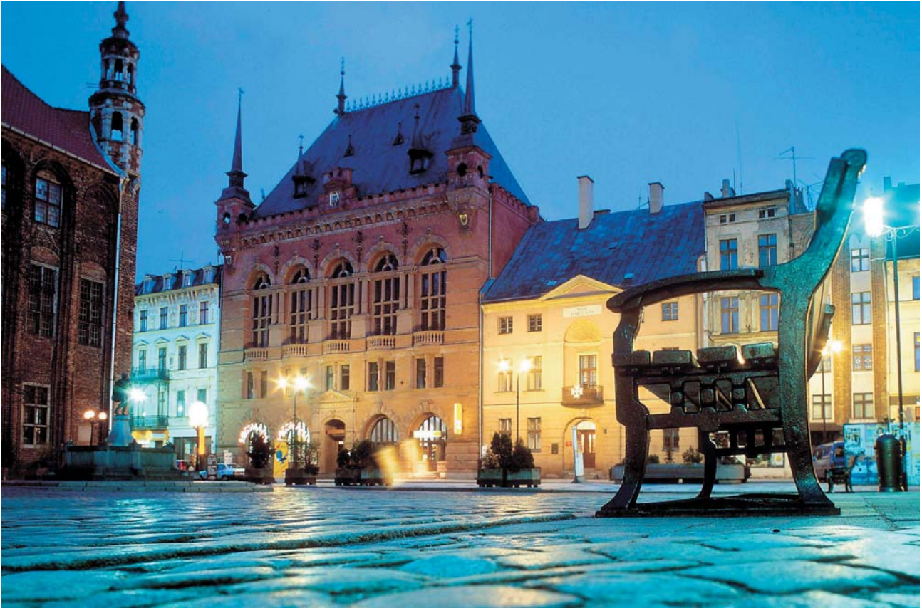
Fig. 6. Toruń – the town of Copernicus, it is famous for its over 300 historical buildings. The Old Town in Toruń has been included into the UNESCO World Heritage Site list

Another city from the list of 7 Polish Wonders prepared by the opinion-forming daily newspaper Rzeczpospolita is Toruń. Strictly speaking it was the Old Market in Toruń that was chosen (Fig. 6). In 1997, the old-town complex with its original medieval urban planning system was included on the UNESCO World Heritage Sites list. Toruń is one of the oldest Polish cities. It is located on two sides of the river Vistula and is the biggest conglomeration of Gothic architecture in Poland. Among the historical buildings that deserve attention are the Old-Town City Hall including a viewing tower, the market square with tenement houses, monuments of Copernicus and Flisak (the raftsman), Gothic churches, Copernicus's house, city walls and gates, ruins of the Teutonic Order castle and the Crooked Tower. In 2004, Toruń was established to be the headquarters of the Union of Polish UNESCO cities.