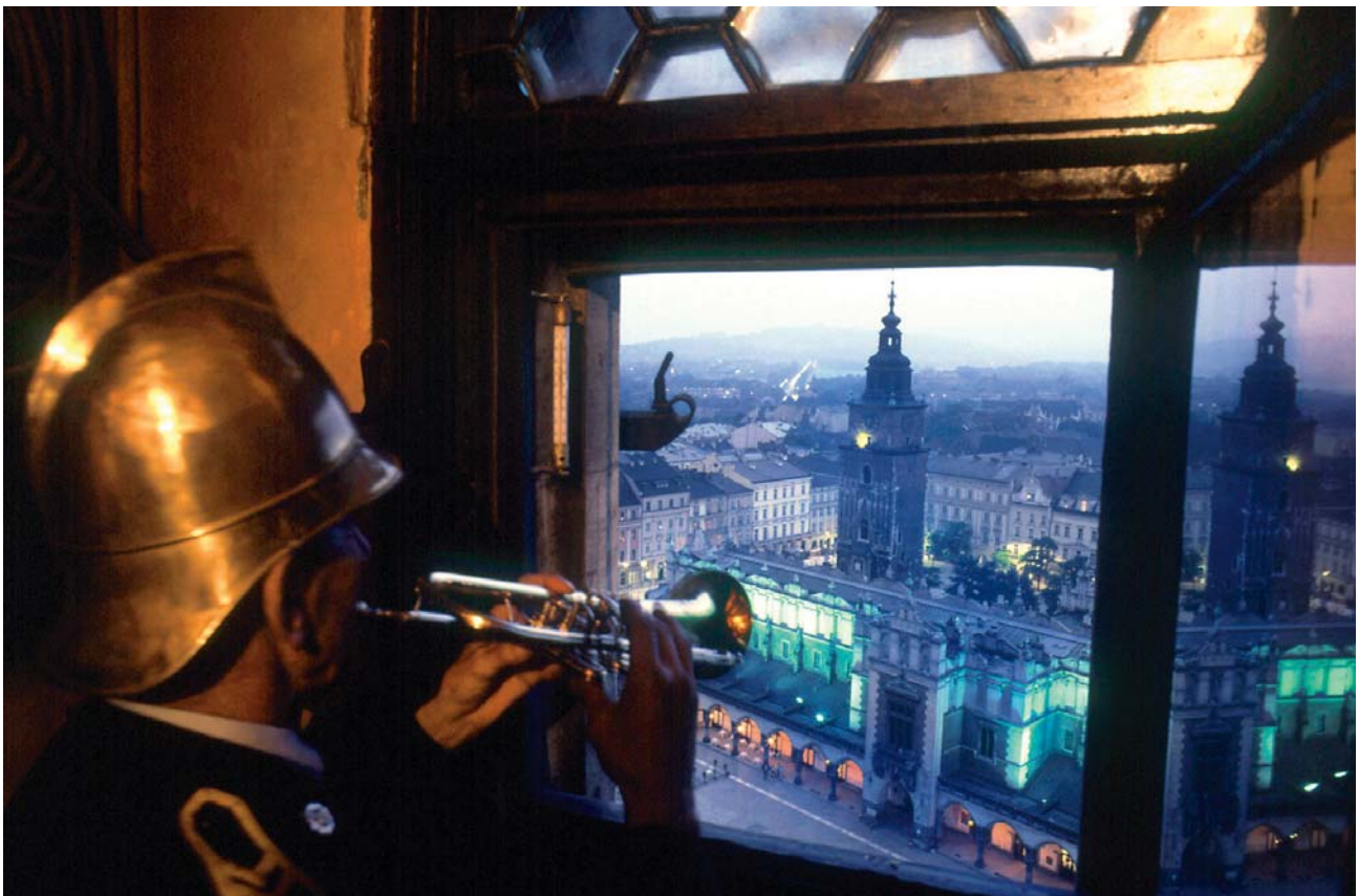
Fig. 3. Bugler in Cracow – every day at noon, from the 81 m tall tower of St. Mary's Basilica in Cracow, a trumpet signal, called the bugle-call , is played. The legend says that in 1241, when a bugler played on his trumpet a melody to warn the town against Tatar's invasion, his throat was pierced with an arrow. Thus, nowadays, the trumpet signal breaks off suddenly