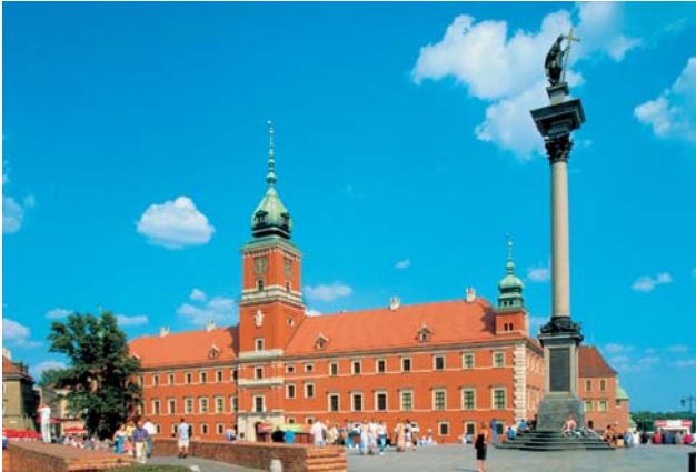
Fig. 2. Warsaw, the Royal Castle, Sigmund's Column.

Cracow was the royal seat and capital of Poland for over 500 years. The historical centre of Cracow – the Old Town including Wawel, Kazimierz (famous old Jewish district) and Stradom, all of which are listed on the UNESCO World Heritage Sites list – gathers the most important monuments of Polish history. At the centre of the Old Town is the main square (Fig. 3). This is one of the biggest medieval market squares in Europe. It is surrounded by historical tenement houses and palaces. In the middle of the square is the City Hall Tower built in the 14th century.