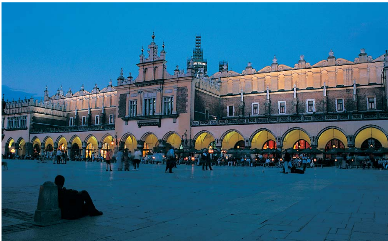
Fig. 4. Sukiennice (Cloth Hall) at the Main Square in Cracow, was once a major centre of international trade. It was built at the end of the 14th century and then rebuilt in the 15th century in the manneristic style. In the 19th century the Sukiennice were converted into a representative building, adding the neo-Gothic arcades. At present, the Sukiennice house collections of the National Museum, as well as coffee and souvenir shops

Two lines of market stalls dated to the 13th century are incorporated into the Renaissance Sukiennice building (the Cloth Hall) (Fig. 4). From the Main Square we go to Wawel via the Royal Route, passing by precious churches and tenement houses.