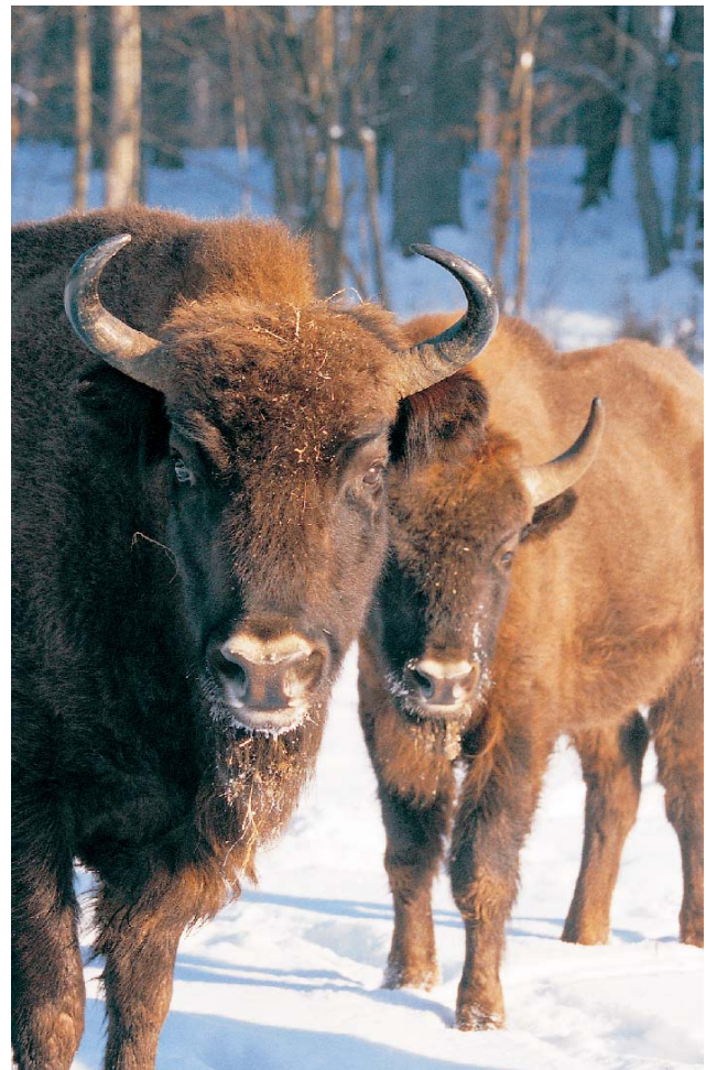
Fig. 12. European Bison – they were almost exterminated in the 18th century. However, the Polish reintroduction of this species was successful. Most of bison live in the Białowieża Forest – circa 250 representatives of this genus. The entire Polish population of bison amount to 660 specimens

The Tatra Mountains. The Tatra National Park comprises mountainous territories on the Polish and the neighbouring Slovak sides and is included on the UNESCO Biogenic Reserve list. It is the highest mountain ridge of alpine type in Central Europe – the highest Polish summit is called Rysy: 2499 m above sea level. Many tourist trails allow the most glorious parts of the mountains to be admired, including lakes, valleys, waterfalls, and caves. The Tatras are inhabited by chamois, bears and marmots. There are good conditions for climbing; speleology and trekking all year round; and for skiing in winter.