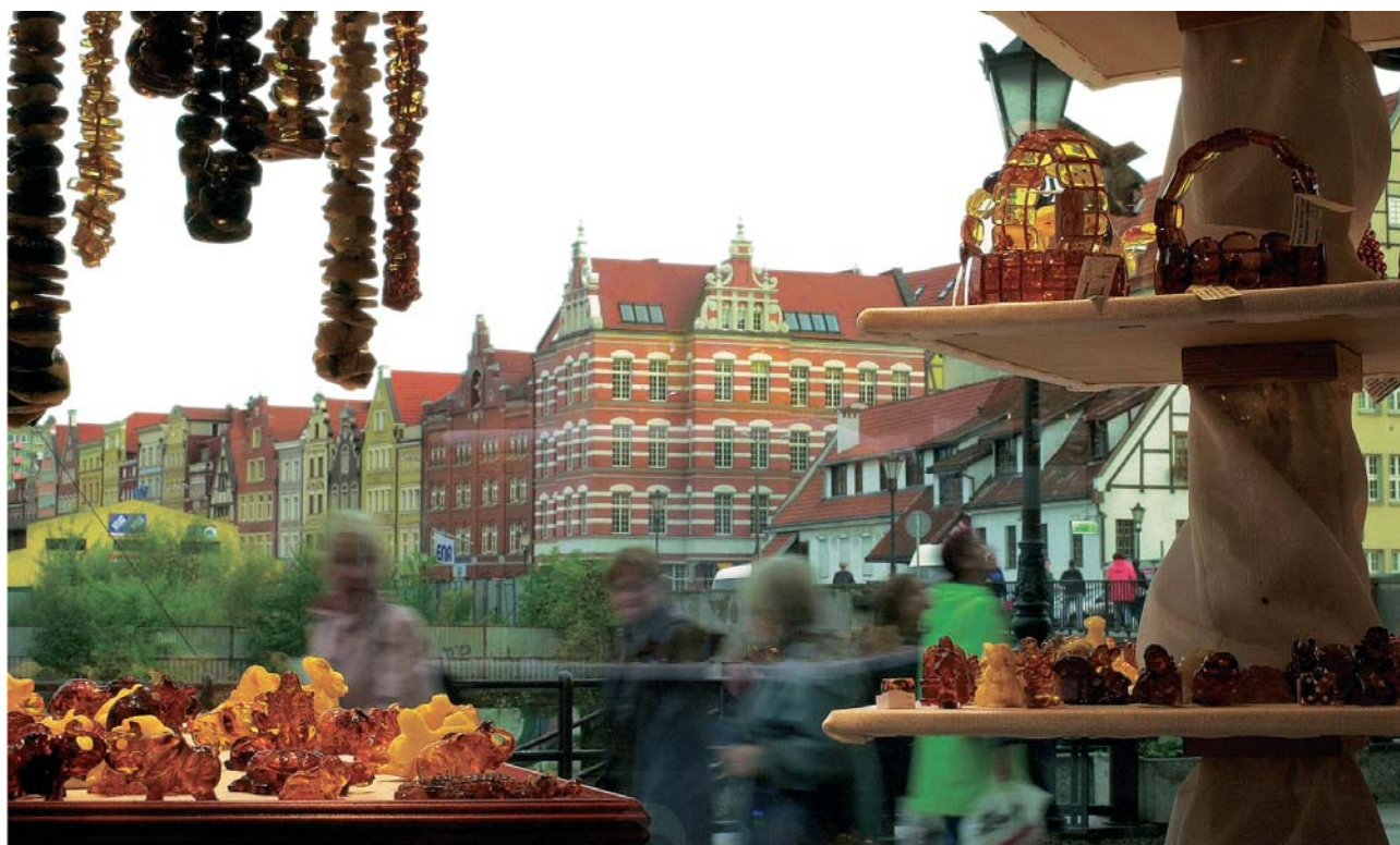
Fig. 8. Gdańsk, Long Bridge, Saint Dominic's Fair

The planning team of this best preserved Renaissance town in Poland referred to a perfect city plan blending Italian architecture. The Old Town has been fully preserved and retains its original layout with the Old City quarter, where a monumental City Hall dominates over a collegiate church, an old orthodox church and a synagogue, the Zamoyski family castle and wonderful tenement houses. It is called loftily the Pearl of the Renaissance , the City of Arcades and Padua of the North . The Old City quarter of Zamość has been placed on the UNESCO list of World Heritage Sites.