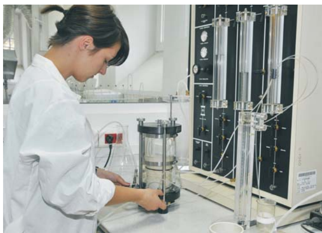
Fig. 5. The test soils permeability coefficient measuring system Trautwein.

High water levels and high soil wetness resulting from prolonged rainfall events induce increased draining pressure on slopes and in high banks of river valleys, and are the most common causes of landslides and ground movements (surface mass movements). Assessments of these threats as well as assessments of areas threatened by them are also the responsibility of the PHS.