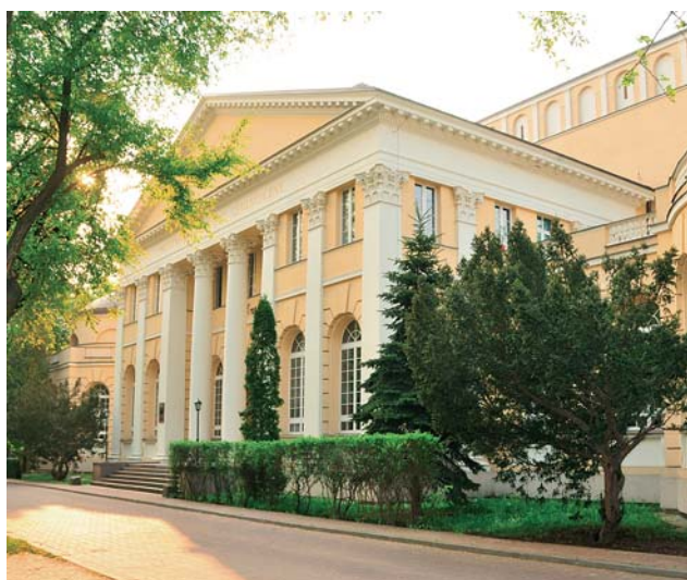
Fig. 1. Headquarters of Polish Hydrogeological Survey (Polish Geological Institute – National Research Institute, Warsaw).