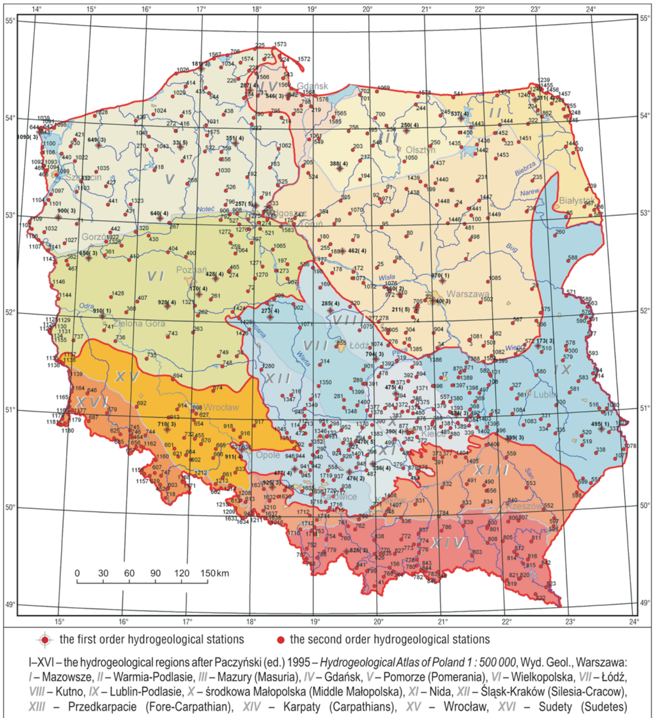
Fig. 4. Location of the PGI-NRI groundwater monitoring hydrogeological stations (PHS material)

Reports on groundwater assessments and/or changes in the availability of groundwater resources are prepared by order of the Ministry of the Environment and, at their request, they can be distributed to other national government departments and institutions or can be used to prepare reports for the European Commission.