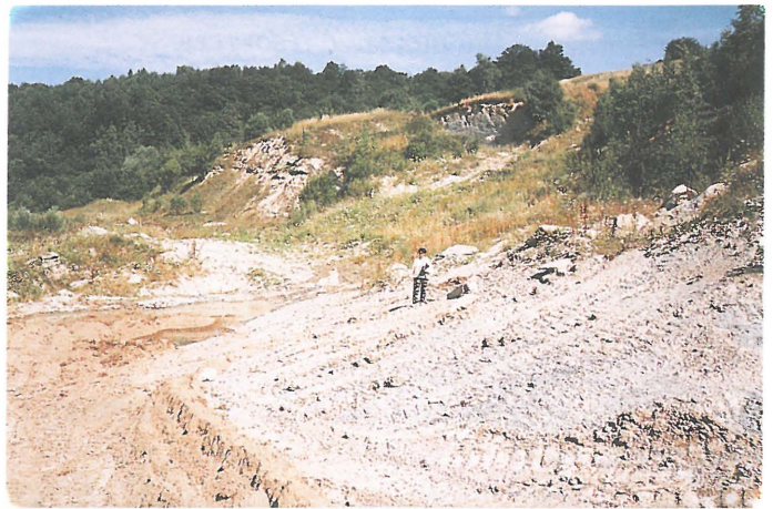
Fig. 6. One of typical Carpathian small brick clays open-pits (Olszanica near Lesko in east part of Polish Carpathians)

The exploitation of natural aggregates from the Dunajec river near Stary Sącz (Fig. 9) has an especially large extent.