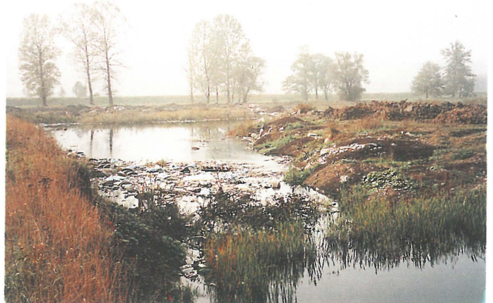
Fig. 8. A gloomy example — transformation of the abandoned mining area into the uncontrolled refuse heaps (Dunajec river valley)

Numerous deposits of a high quality of aggregates have been proven here. Out of a vast area (several dozen hectares) under excavation practices, only 10% have been reclaimed and converted in rest areas. The remaining terrain is unmanaged and subjected to a natural overgrowing with vegetation.