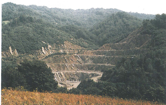
Fig. 1. The view on the Tenczyn Górny quarry in Beskidy Mts.