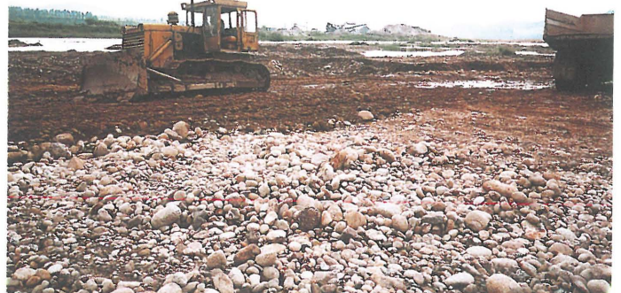
Fig. 7. Natural aggregates excavation in the area of Czorsztyn water reservoir