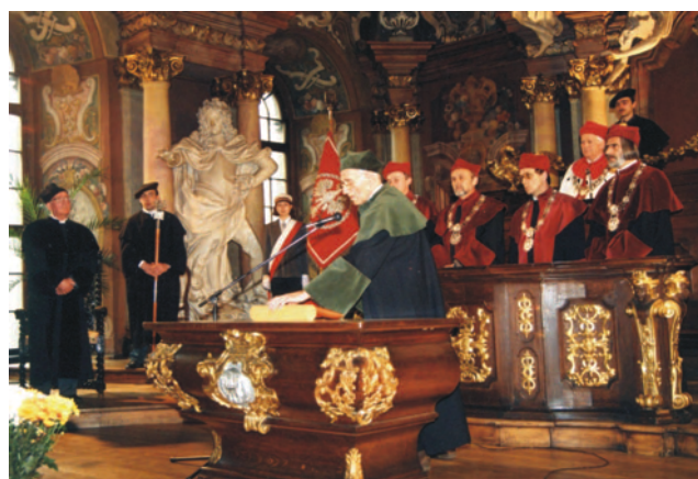
Prof. Józef Oberc celebrating the 50 th anniversary of his PhD defence, Aula Leopoldina, 1997

ved to be correct: this nappe model has been supported by later structural, petrological and geochemical studies. Not only that, but his early assumption of a Proterozoic age for the gneisses in the area was recently confirmed in a number of publications, and his interpretation of the boundary between the large lithospheric blocks of the West and East Sudetes ( The boundary between the Western and Eastern Sudetic structure , 1968) and its exact location, more easterly than was assumed at the time, is also still correct.