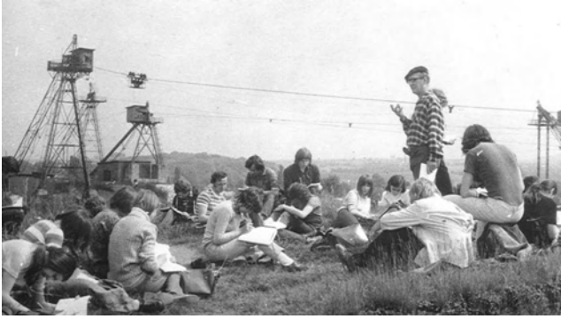
Student field course, Strzelin 1973.