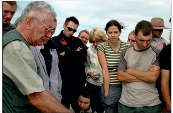
Field-course “Present-day processes in the Baltic coastal zone and their fossil record”, Łeba 2005.