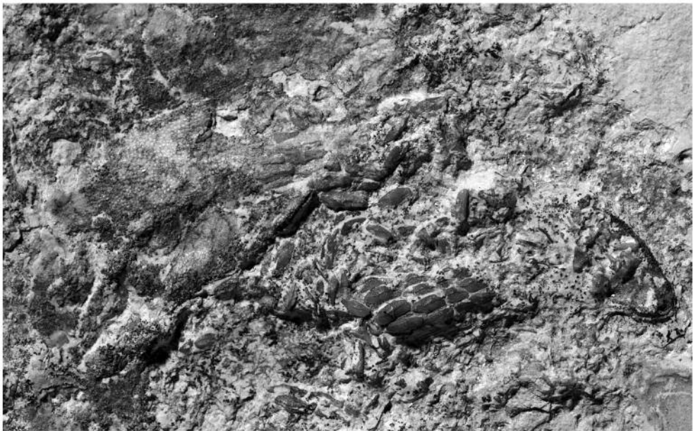
Fig. 3. Adult specimen of Paracestracion falcifer (WAGNER, 1857) (holotype, BSPG AS VI 505), from the lower Tithonian of Solnhofen, S. Germany. 1 – Complete specimen. Scale bar equals 5.0 cm. 2 – Close-up of disarticulated dentition displaying cuspidate anterior and molariform lateral teeth. Scale bar equals 0.5 cm.